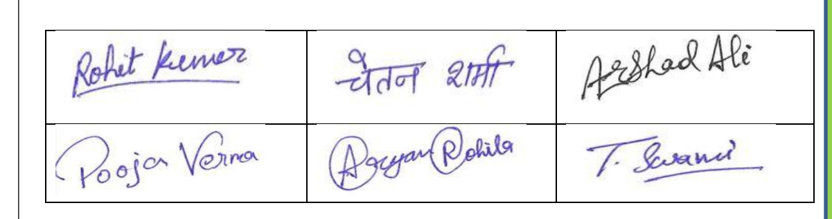
Table 6B: Samples of not Acceptable Signatures